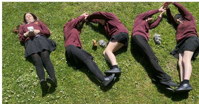
Eco Club students celebrating Sir David Attenborough's 100th birthday