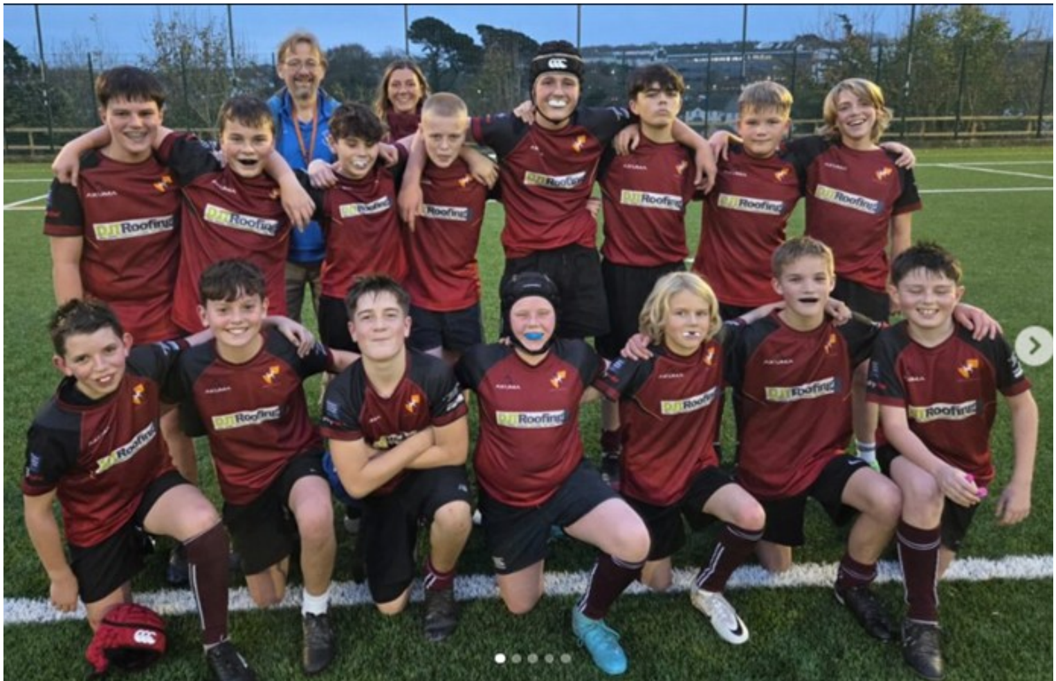
Our year 8 rugby team had a pre season friendly against Kingsley and won