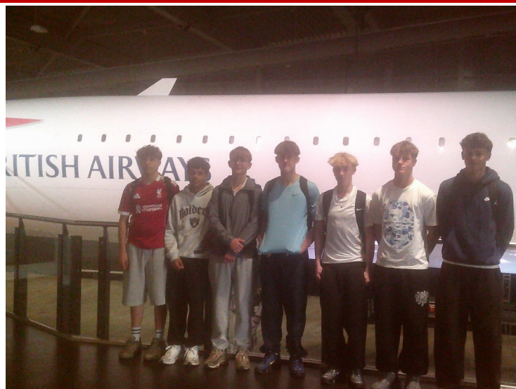
Year 10 students visited the Aerospace Museum in Bristol - see Page 3