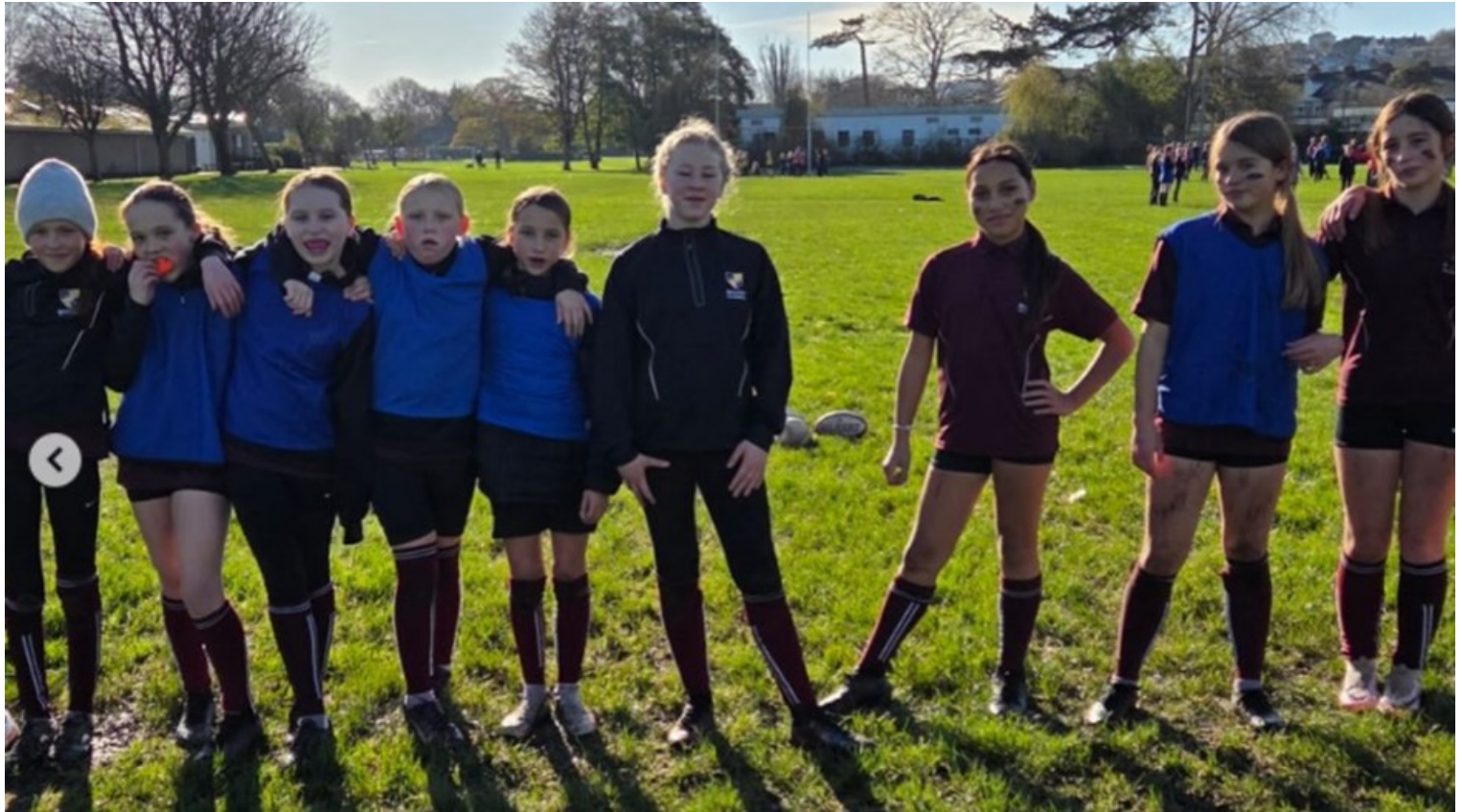
A group of year 7 girls travelled to Bideford for a rugby taster session a few weeks back and thoroughly enjoyed their experience