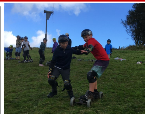
Year 7 Bonding Experience