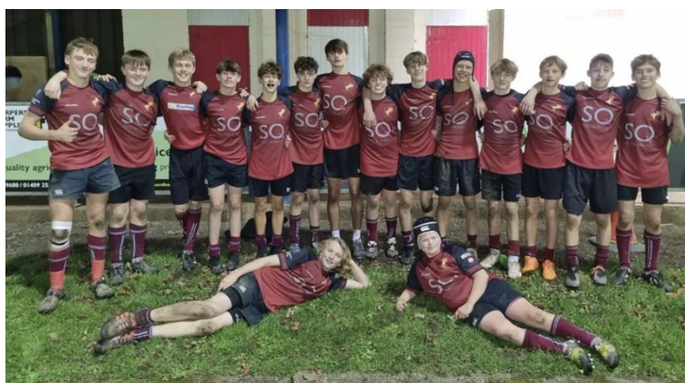
North Devon Schools Cup Winners